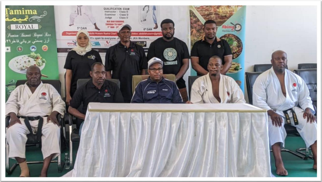
Figure 5: At center is the Principal Secretary of the Ministry of Education and Vocational Training of the Revolutionary Government of Zanzibar when closing ceremony.