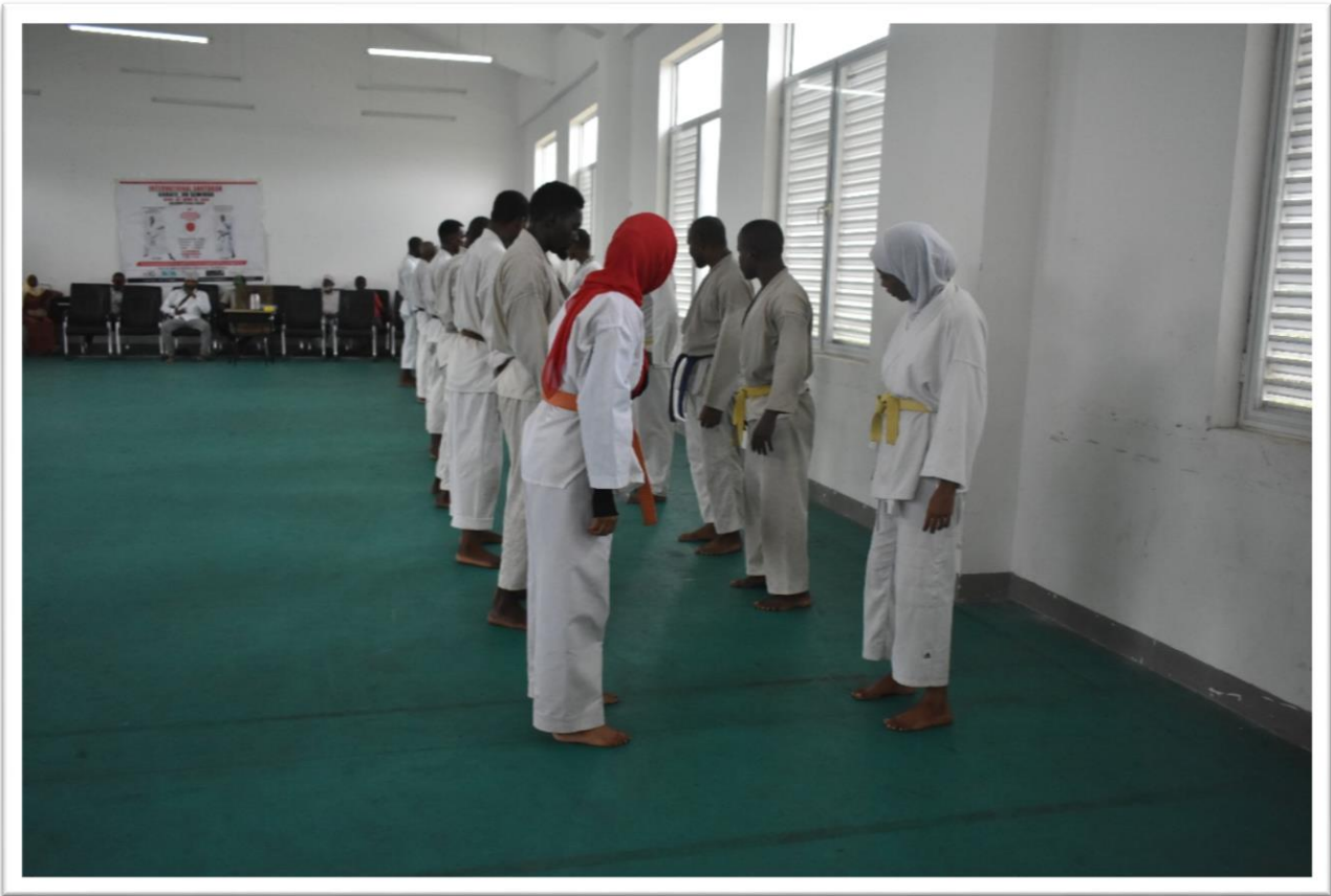
Figure 3: Students participate in First gashuku semina at Tumekuja Secondary School Zanzibar.