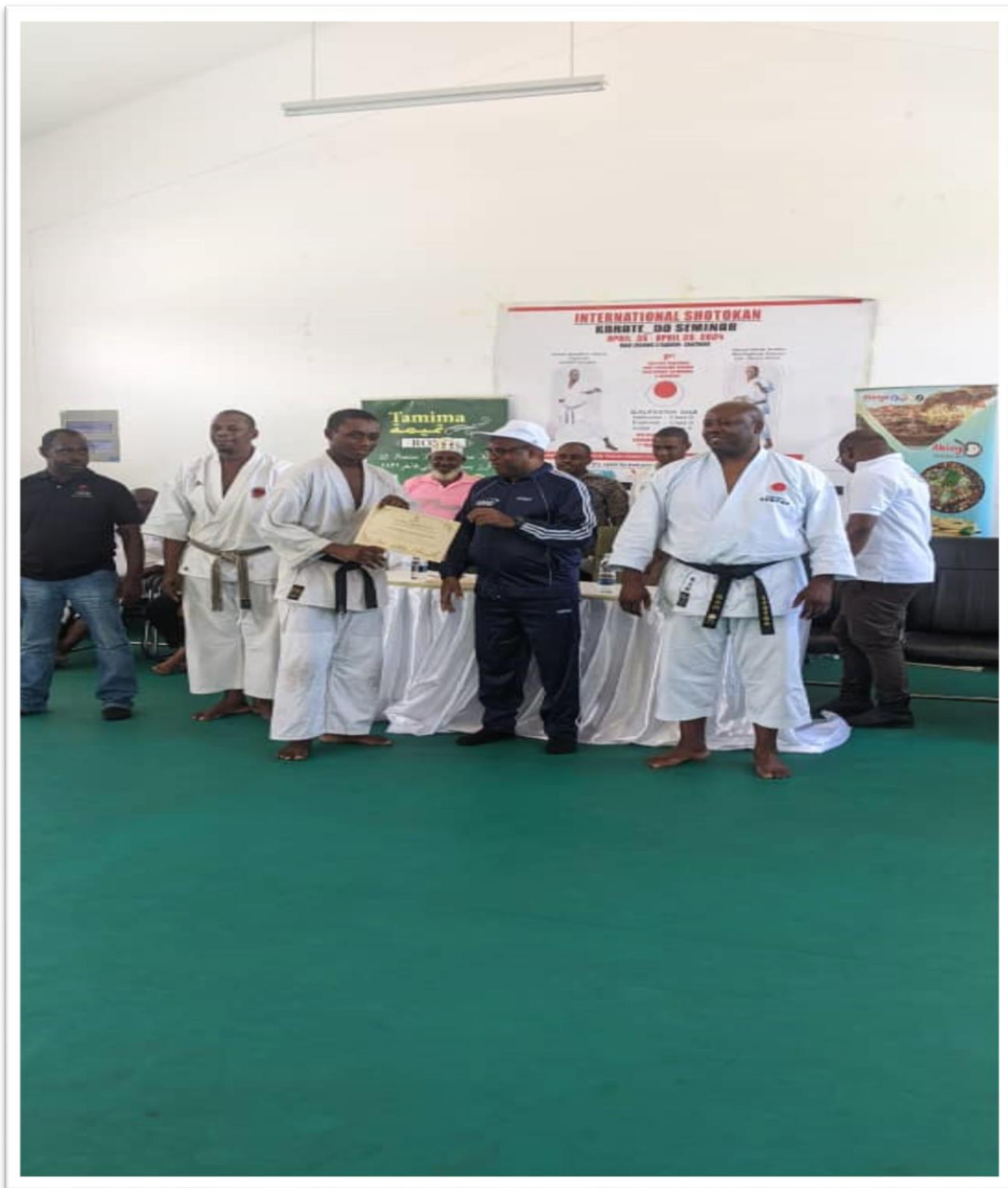
Figure 6 : The Principal Secretary of the Ministry of Education and Vocational Training of the Revolutionary Government of Zanzibar giving the Certificate of participation to 7 students who did Dan Examination.