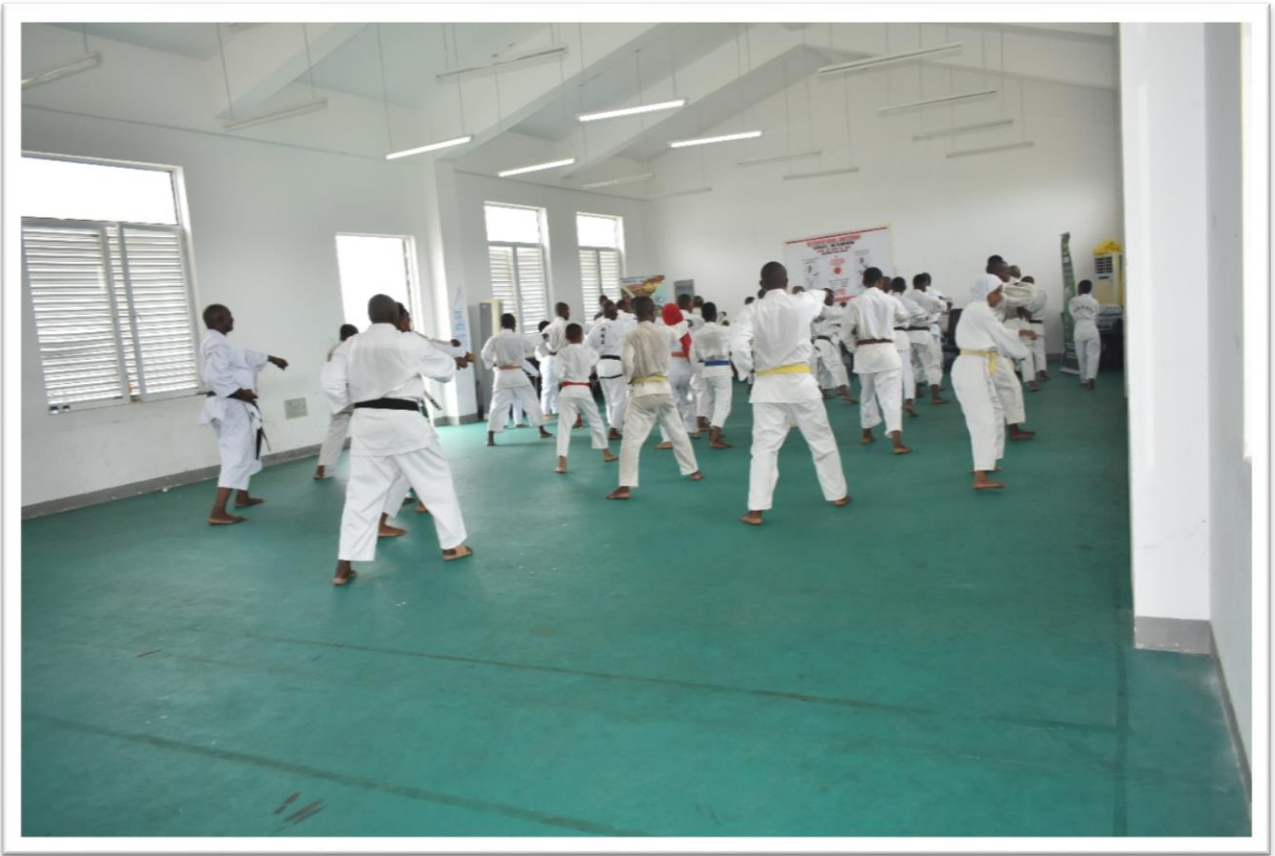
Figure 5 Students during training.

The Day 2 seminar was held at the Mao Zedong Stadium Multipurpose Sports Hall. The training focused on kumite drills designed to maximize penetration of attacks. Participants were also taken through Heian katas 1-5, plus Tekki Shodan and Jion.